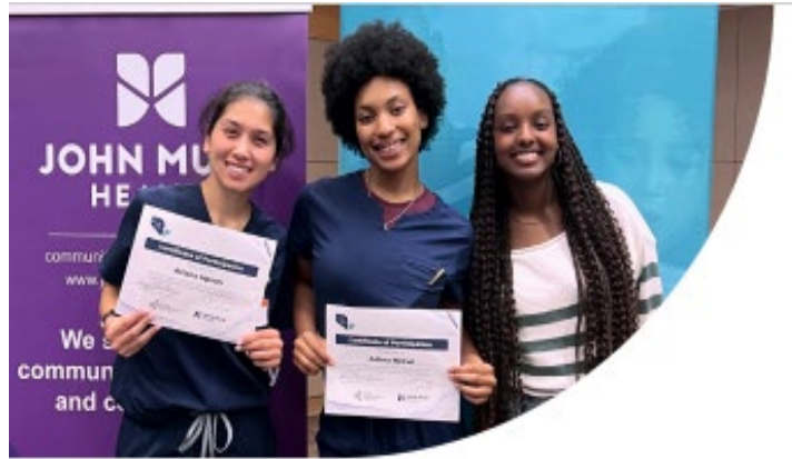
John Muir Health Young Healers High School Student Interns

Most clinical service lines lead and operate a community service initiative. For example, our Trauma Department leads the hospital-based violence intervention program, Beyond Violence. John Muir Health's Magnet® recognized nurses, the highest recognition in nursing, are leaders in providing community service, for example nursing participation in Habitat for Humanity Women’s Leadership Build and as mentors for our Young Healers High School interns. Employees contribute when they participate in department programs and when they volunteer for John Muir Health-sponsored community events.