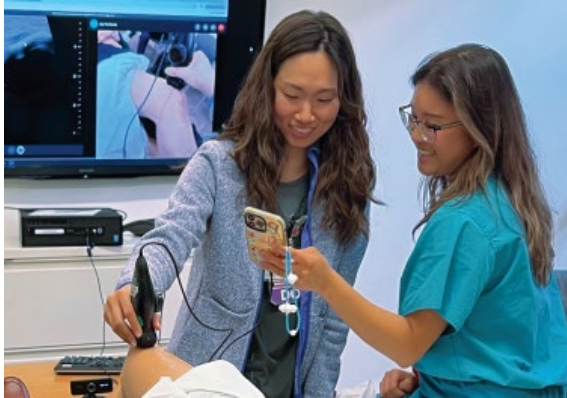
John Muir Health Family Medicine Residents

John Muir Health has long valued a systematic approach for identifying community health needs in order to guide thoughtful and effective Community Benefit investment. In 2022, John Muir Health conducted a triennial Community Health Needs Assessment (CHNA). The Patient Protection and Affordable Care Act, enacted on March 23, 2010, includes requirements for nonprofit hospitals that wish to maintain their tax-exempt status. Regulations finalized December 31, 2014, also provide guidance related to section 501(r) of the Internal