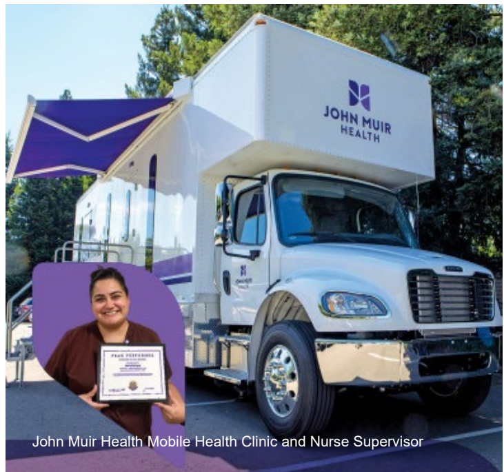
John Muir Health Mobile Health Clinic and Nurse Supervisor