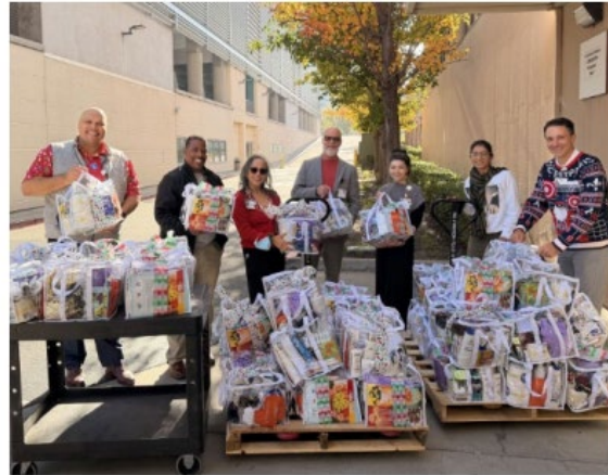
Photo: JMH Leadership Team contributed Toiletry Kits to Monument Crisis Center

John Muir Health contributes many non-quantifiable benefits at each of our facilities. The health system continually provides leadership in the community, assists with local capacity building, and participates in community-wide health planning. In addition, John Muir Health is committed to upholding the highest environmental standards and has invested in efforts for sustainability.